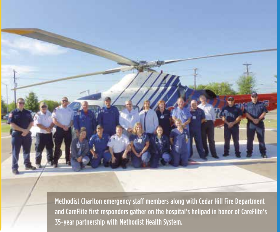
Methodist Charlton emergency staff members along with Cedar Hill Fire Department and CareFlite first responders gather on the hospital's helipad in honor of CareFlite's 35-year partnership with Methodist Health System.