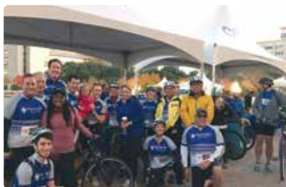
Members of the Methodist Dallas cycling team gather for a photo at the Dallas Bike Ride in November. The hospital was a presenting sponsor of the Finish Festival.